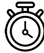
Time & Attendance