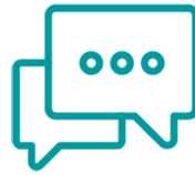
Communication & Change Management